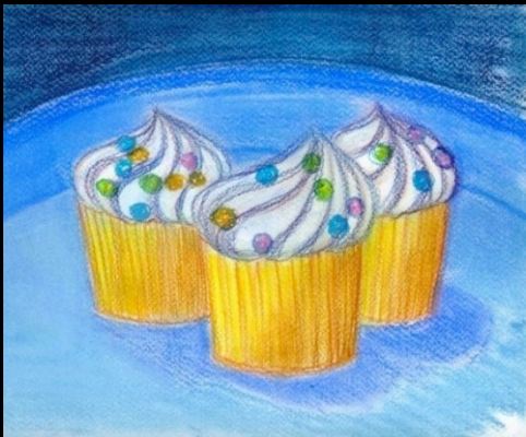
"Cupcakes" by Judith Heim c 2009