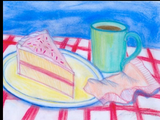
"Piece of Cake" by Judith Heim c 2009

Samples by Judith Heim c 2009 all rights reserved. These three images may not be used Beyond this lesson plan without permission from the artist.